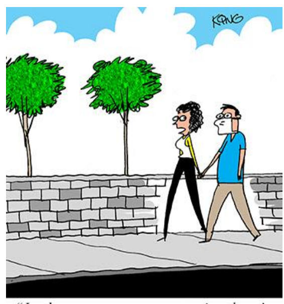
"Just because my computer got a virus doesn't mean I caught one from it, and will give it to you. Computer viruses aren't contagious to people."