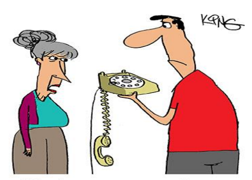
"Yes, I got you a rotary phone. Dialing it should give you a little exercise."